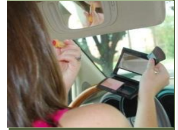
Distracted Drivers in Crashes (Other than by Electronic Device)