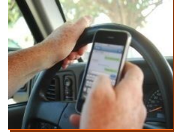
Distracted Drivers in Crashes by Electronic Device By Age and Sex