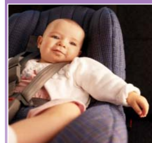
Infants in Crashes (2010-2012) In Passenger Vehicles/Pickup Trucks Infant Age & Infant Injury Severity

Comparison of two time periods, 2007-2009 to 2010-2012, shows an increase of 39.3% in the number of infants involved in crashes. However, infant fatalities decreased 66.7% from six (2007-2009) to two (2010-2012) and infants with serious (incapacitating and non-incapacitating) injuries decreased 23.8% from 80 (2007-2009) to 61 (2010-2012).